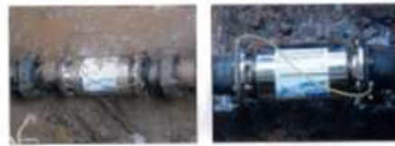
in front of Myeongji University