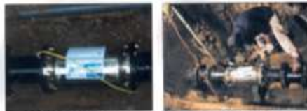
in front of Singyeong Apartment